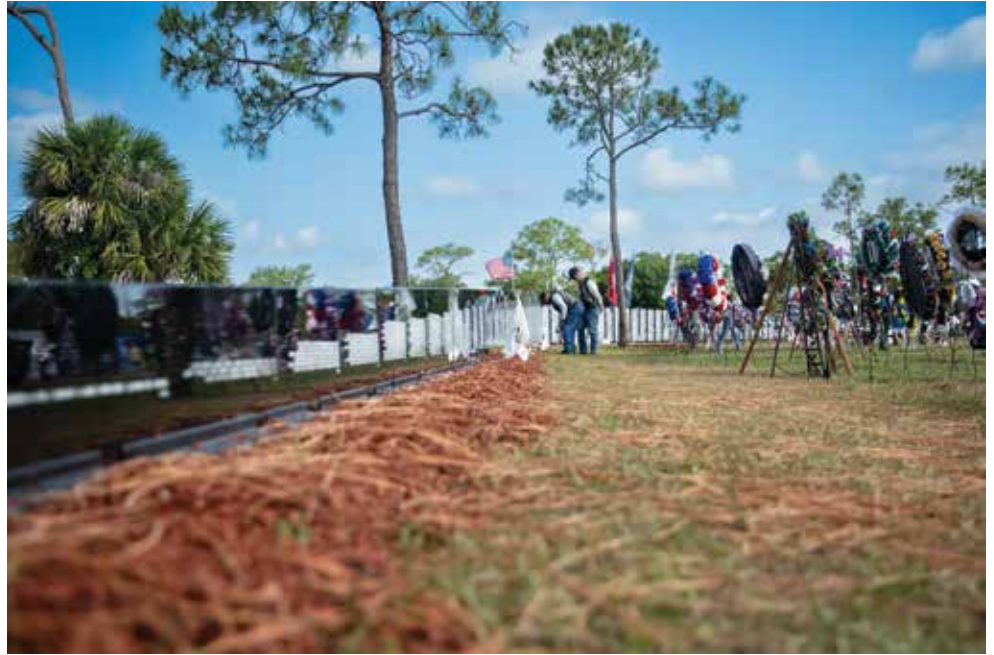
Some gave it all. The Traveling Moving Wall at Wickham Park stands as a reminder of the great sacrifices made during the Vietnam War.