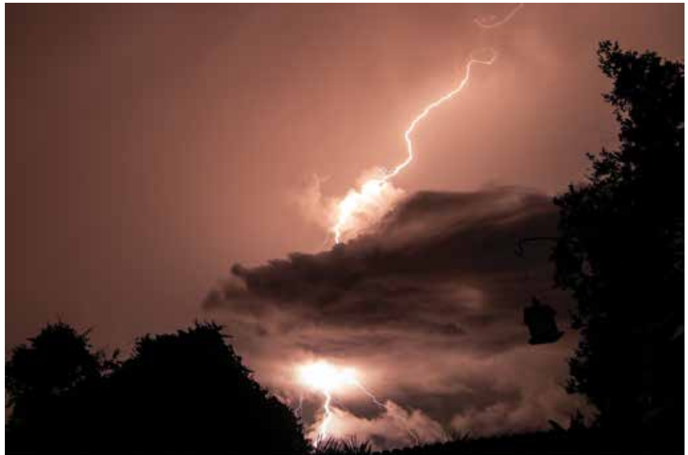
Not the summer weather dynamic quite yet, but last month Florida experienced some severe thunderstorms coming from the north. Always a light show!

Read Brevard Live Magazine online www.BrevardLive.com/flipbook