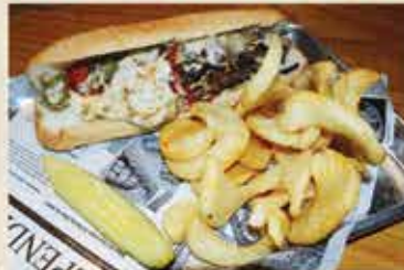
PHILLY CHEESE STEAK