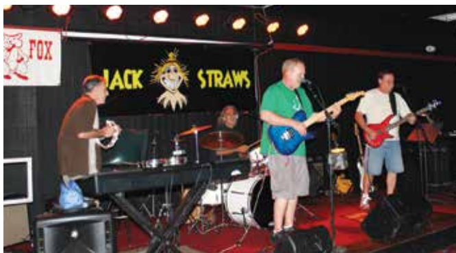
Where did this band come from? Group Therapy was a tight little band with a big sound.

ning, no surprise there, he grew up in this county, knows everyone and has always been "Mister Popular" around here. "Glad you could make it," he said to me and handed me a paper with other popular jams in this county. "You need to come out more often and get re-acquainted with the players." Point well taken! It was great to see so many familiar faces and everyone having a good time.