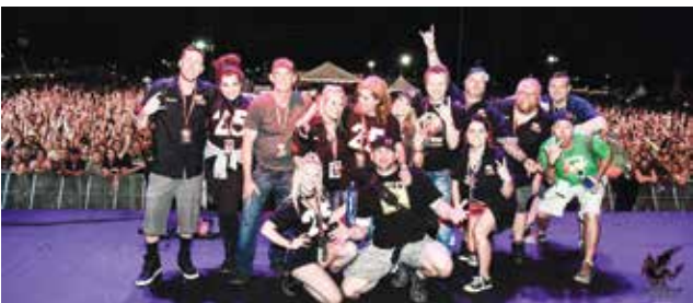
WJRR staff at the end of a successful event.

The night closed off with incredible performances from Seether and Shinedown. I had never seen a crowd so immersed within a song as when "Second Chance" was performed by Shinedown. Many hearts were touched. Overall the event was a true success, and from what I have gathered, this was the biggest turn out yet for WJRR's Earthday Birthday. We all know we are in the age of streaming. Music streaming is how most of the population listens to their music. The point I am making is that it is extremely impressive to see the thousands of people going out to support a Central Florida radio station such as WJRR. So with that said, turn on those radio stations and keep the FM cranking because Florida wants Earthday Birthday around for a long time! See you all at the next one.