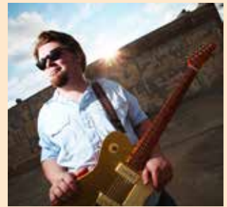
Sunday, Nov. 20, 2-6pm Earl's Hideaway, Sebastian