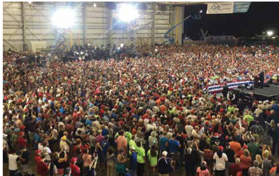
Full house at airplane hangar for the Donald Trump rally at the Melbourne International Airport last month.

that, or who you support, one thing is clear - Donald Trump speaks his mind, and that seems to appeal to a lot of people who are tired of the double speak we have all become accustomed to...no matter what comes out of his mouth.