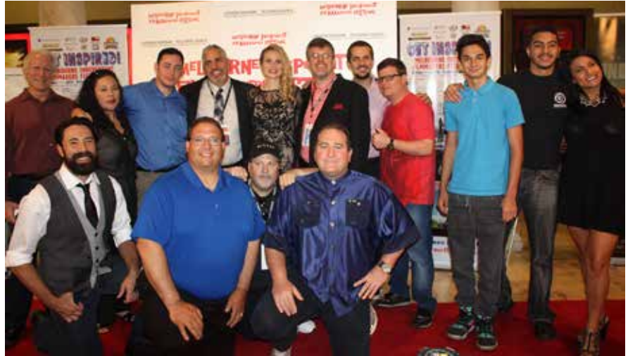
Some of the Paying Mr. Getty film cast and crew on the red carpet. This film won the Best Action Adventure Film award.

The theme of this years Melbourne Independent Filmmakers Festival or MIFF was to 'GET INSPIRED', and it certainly met that criteria. Originally scheduled for early October and in its 18th year the annual festival was delayed by a visit from hurricane Mathew until the 20th through the 22nd, and despite the change of dates played host to record breaking attendance on all three days.