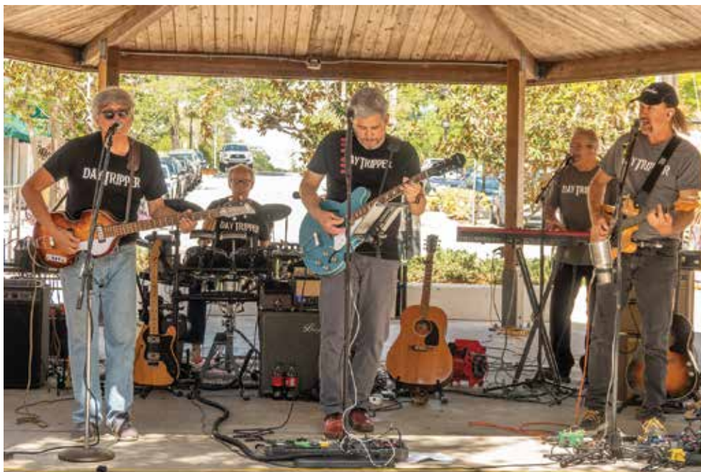
The Day Tripper Band performs Beatles songs at the Gazebo at 9 Stone Street for the Cocoa Village Summer Art and Craft.

Read Brevard Live Magazine online www.BrevardLive.com/flipbook