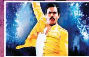
KILLER QUEEN A TRIBUTE TO QUEEN OCTOBER 21 | 8 PM