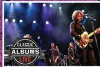
U2 THE JOSHUA TREE SEPT 24 | 8 PM