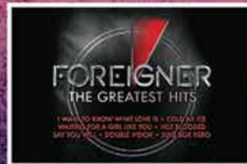
FOREIGNER THE GREATEST HITS NOVEMBER 20 | 8 PM