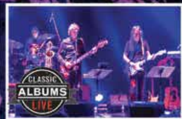
DIRE STRAITS BROTHERS IN ARMS AUGUST 13 | 8 PM