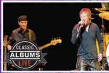
THE WHO WHO'S NEXT JULY 16 | 8 PM