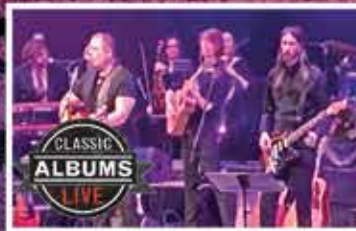
BILLY JOEL THE STRANGER OCTOBER 22 | 8 PM