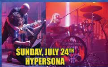
SUNDAY, JULY 24 TH HYPERSONA