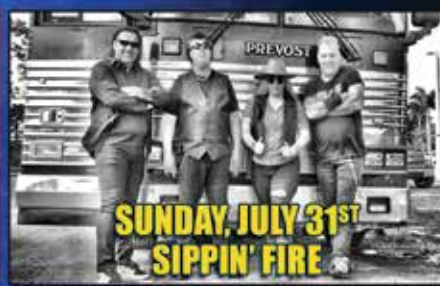
SUNDAY, JULY 31 ST SIPPIN' FIRE