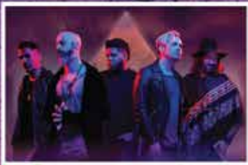
DAUGHTRY THE DEARLY BELOVED TOUR SEPT 18 | 7:30 PM