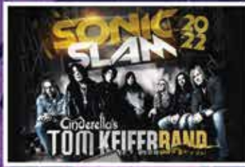
SONIC SLAM '22 TOM KEIFER BAND JULY 22 | 7 PM