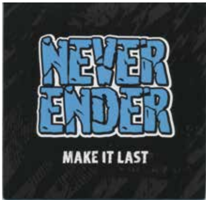
Never Ender Make It Last

This month's review is for the young Punk band Never Ender titled Make it Last . Never Ender, from Melbourne, was formed in early 2018. They have opened for national acts Supervillians and The Ataris.