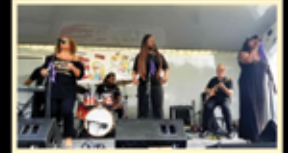
Ladies of Soul Motown, R&B, Dance, Disco & Top 40