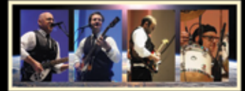
Across the Universe The Ultimate Beatles Tribute Band