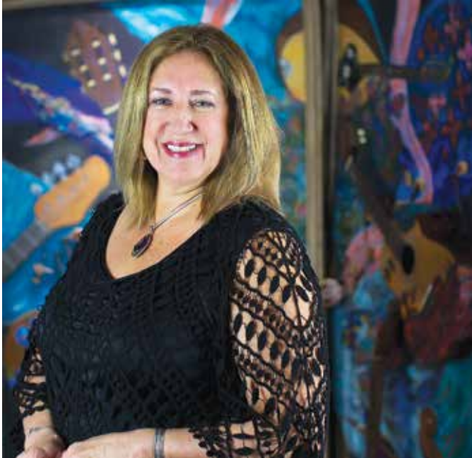
Artist and Musician