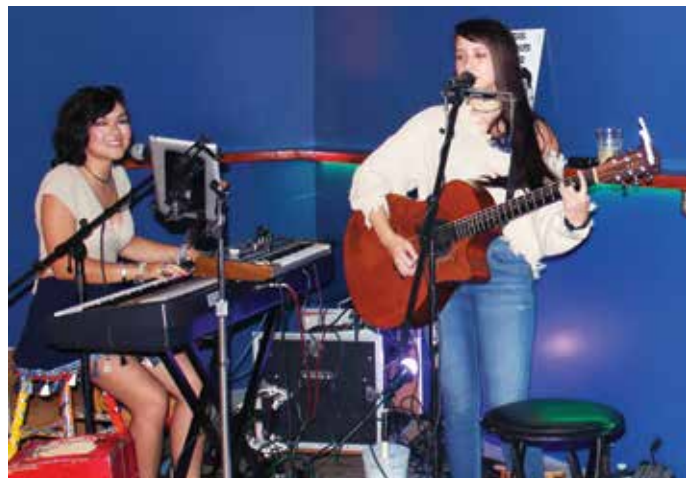
The Gemini Band charmed their audiences.