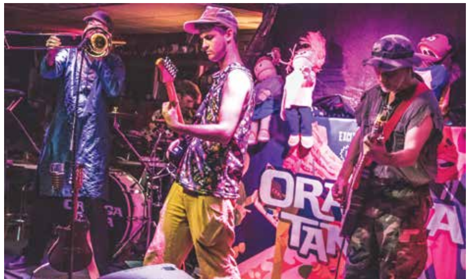
At their last show at Open Mike's Oranga Tanga included their own sets of muppets.

To connect with them go to www.orangatanga.com or via Facebook.