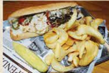
PHILLY CHEESE STEAK