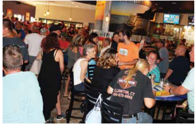
The Tap Room was packed to the max.