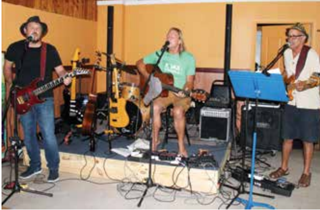
The Radio Flyers are a comfortable band with great harmonies. It was a perfect fit for this evening.

fed and free range. Your go-to for clean eating, gluten free and vegan. It is home to delicious wraps, sandwiches, fresh salads, and all natural soups. Full smoothie, wheat-grass and fresh juice are also available. Hot lunch bar is open Monday through Friday. The cafe hours are Monday through Saturday 9 am to 7 pm and Sundays from 10 am to 5 pm. The prices are surprisingly low, most sandwiches and wraps run you around $6.99, the salad bar is $7.99 per pound, and the hot bar $8.99 per pound. They also advertise the best soups in town starting at $3.79 for 12 ounce. Not bad.