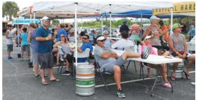
Tent spaces provided outside shade.