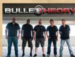
Bullet Theory: April 10/17/18