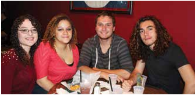
The Undefined, Brevard's newcomers, were the first performers at Sigfest.

up. Keep your eyes open for the next show of the tour and be sure to check out these talented young musicians! More about them all and the Teen Tour in next months issue as well.