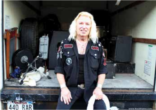
Black Oak Arkansas performed last month at Lou's Blues.