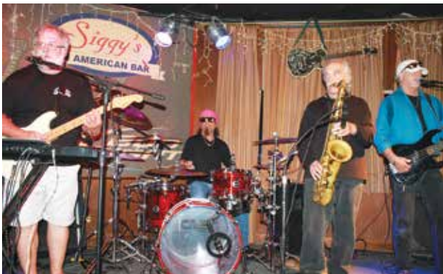
Burnt Toast played your favorite oldies at Sigfest before rockers Adawak, Funpipe, Bullet Theory and Mayhem took the stage.