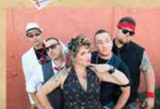
Rock Candy: April 25