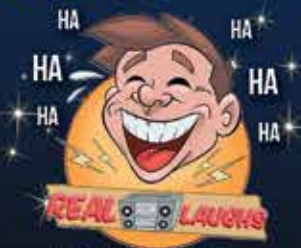
TIME OUT TO LAUGH

JULY 27 TH REAL RADIO 104.1 & REAL LAUGHS COMEDY CRUISE PM CRUISE