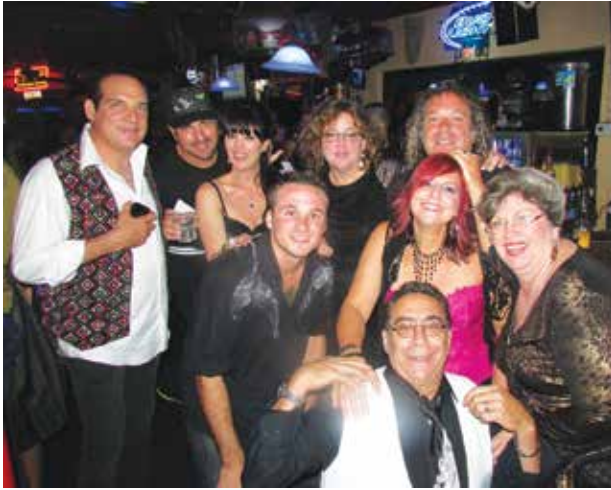
BMA's After Party at Lou's Blues became an unforgettable Super Jam hosted by our friends from Spanks.

them all in a column this small. We do, however, want to mention WEEP, the all female band that has begun to make some waves around Brevard. We were treated by a set from them at our Rockstar Jam at Lou's Blues as well!