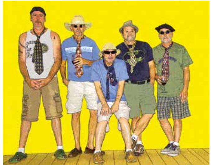
October 20th: GoFoot Band

They are followed by My Second Summer , a great power pop band from Melbourne featuring members formally of A Turnaround Life and Lita Gray.