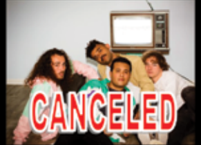
The Spring - Alternative