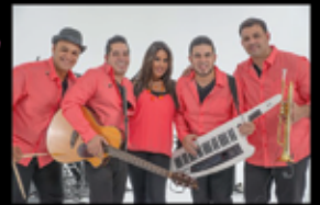
La Calle Band

Latin/Pop, Merengue, Bachata, Salsa, and Dance