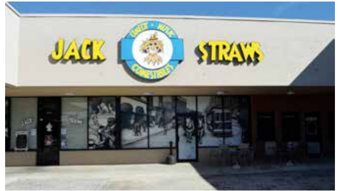
Jack Straws in NE Palm Bay