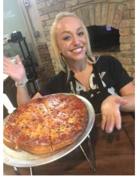
The wood fired pizza oven is an attraction by itself and the pizza is proof

wood fired pizza, it's hard to turn back. The first room has both, bar seats and booths, but you might find all the action is in the other room. The stage is 10 by 30 feet, has its own sound and lighting system, and the hall seats approximately 150 people with easy access and terrific views of the show.