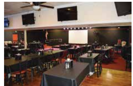
Pizza, lobster dinner specials, live music, shows, comedy - Jack Straws is always a good time.