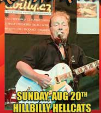
SUNDAY, AUG 20 TH HILLBILLY HELLCATS