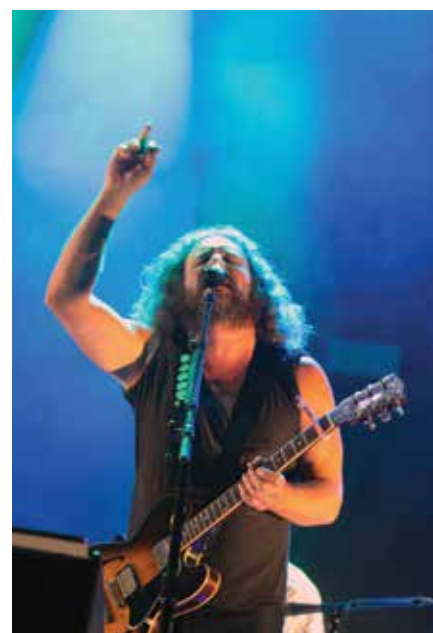
My Morning Jacket

someday you can join me and see what all the fuss is about. I tell people this every year: if you only lived your life for those four days in June it would be worth it. Now, that's not true of course, it's hyperbolic, but I will tell you that every time I drive into the campgrounds I feel like I just got home, and every time I leave, I get a little sad. It's called the Bonna-blues, actually, yeah, it's a thing. By the way, we met quite a few people from Brevard County this time around which tells me there might be a couple of you paying attention to what I'm telling you. Cheers to that!