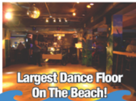
Largest Dance Floor On The Beach!

All Proceeds benefit the Joe Realino Memorial Fund