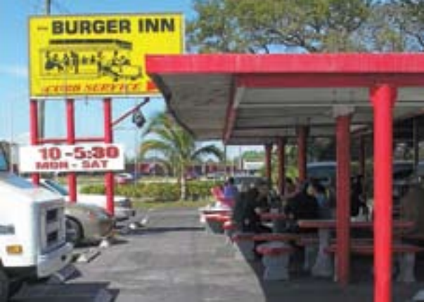
The Burger Inn On US 1 In Melbourne: